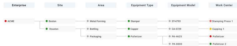
Centrally manage all of your XL devices with the Management Console.